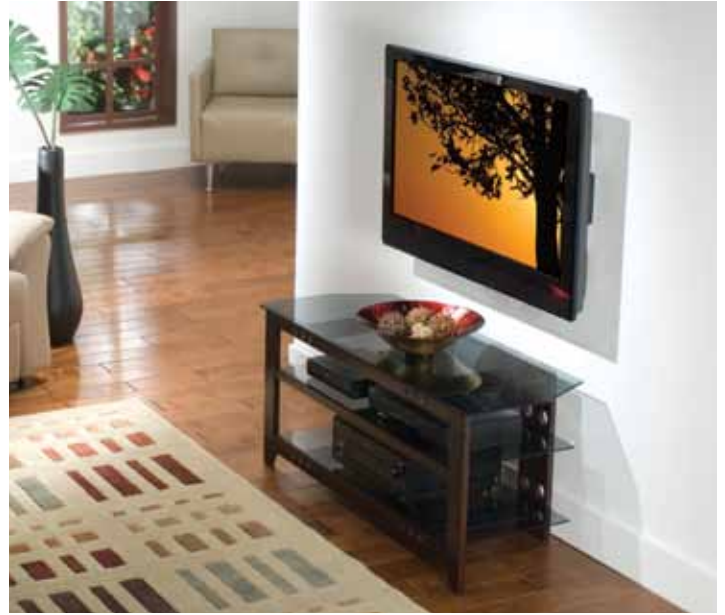
model LL22 shown

The new LL22 low-profile mount was designed to make installation a breeze. This sturdy, ultra-light mount is constructed of extruded aluminum and features an open wall plate design for easy cable management. Our exclusive ProSet™ height and leveling adjustments ensure TVs are always perfectly positioned after mounting. The innovative ClickStand™ feature holds the TV away from the wall for easy cable installation, then clicks securely back onto the wall plate. ClickFit™ system allows power conditioners and other small devices to be positioned directly behind the TV and easily clicked onto the mount, so they stay hidden yet easily accessible. And the low-profile LL22 sits nearly flush against the wall, maximizing the sleek, thin look of a flat-panel TV.