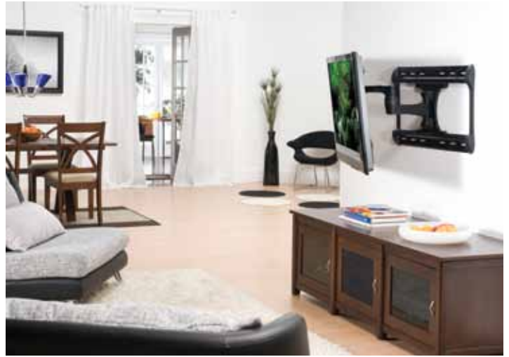
model LF228-B1 shown

The HDpro™ Series XF228 and LF228 mounts were engineered with the custom installer in mind. They feature pre-assembled interfaces and strong, ultra-light extruded aluminum wall plates for the easiest and quickest installation possible. The QuickConnect™ system allows the mounting head to snap onto the arm assembly with one easy movement and unlock with the push of a button. ProSet™ post-installation height and leveling adjustments ensure TVs are always perfectly positioned after mounting. But here's the major innovation: these sturdy mounts feature FollowThru™ in-arm cable channels, which protect and completely conceal all cables without inhibiting movement, even through the joint.